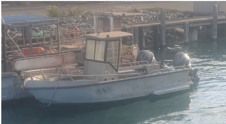
Dive Vessel “Sarafore”

Mariners are advised to keep well clear of the dive vessel “Sarafore” which will display the necessary signals when dive operations are in progress.