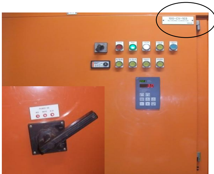
Figure 2: Local Isolator