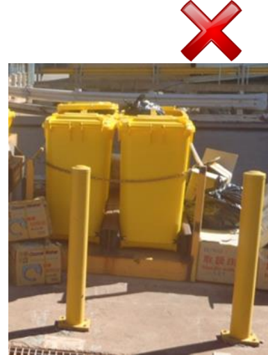
Quarantine Skip Bins