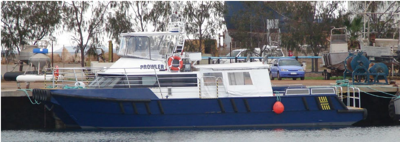
Hydrographic Survey and Utility Vessel “Prowler”

Any questions or feedback regarding this Local Marine Notice should be addressed to the Mid West Port Authority Marine Team.