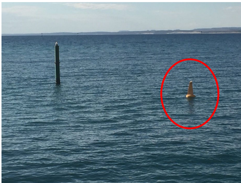
Yellow Spar Buoy marking the Submerged Obstruction

All users of the FBH are advised to keep well clear of this obstruction when navigating in the vicinity of the entrance to the FBH.